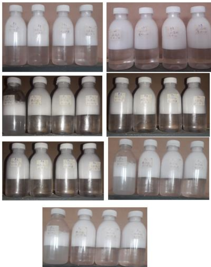
Figure 5. Showing foaming stability of SDS (0.01g, 0.02g, 0.03g and 0.04g) solution at different interval (T1-T7)

by thorough shaking. The bottles were kept tight by lid to minimize the air effect as well as dust dissolution in the foam. The foaming stability was thoroughly examined by using digital camera picturing after 30 minutes interval and also by measuring the foam height. It is clearly indicates that the foaming stability as well as the height of SDS foaming remain stable for a long interval of time and the foaming even continue after 24 hours as shown in Figure 5 and Table 5. These results explain that a small amount of SDS solution give a stable foaming rather than locally synthesized detergents.