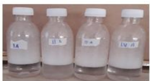
Distilled Water (T3)