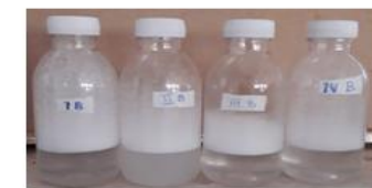
Tape Water (T3)