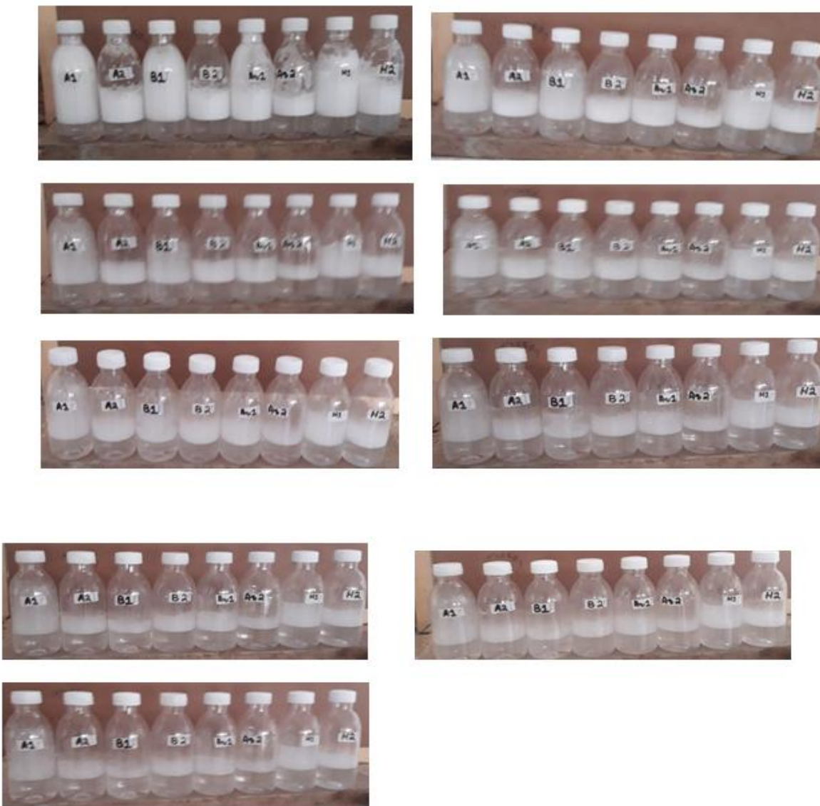
Figure 2. Showing foaming stability using 0.02 g of various detergents solutions w.r.t time (T1-T9)

complete solubility of the detergents in water. The bottles were kept tight by lid to prevent air and dust particles. The solutions bottles were placed on smooth surface for observation and taking pictures at regular interval. The time interval is kept 30 minute and last picture is taken after 24 hours for study the foaming stability in form of bubble foam and noting height of the foam and bubbles above solution surface. From the studying and thorough observations of the foaming and height of the bubbles and foaming above solution surfaces, it reveals that detergent A and B show good foaming stability than the other two as shown in Figure 2 and Table 2. The literature survey also depict that those detergents having excellent foaming ability and maintained height are better detergents for cleaning purposes and economic point of views.