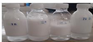
Tape Water (T1)