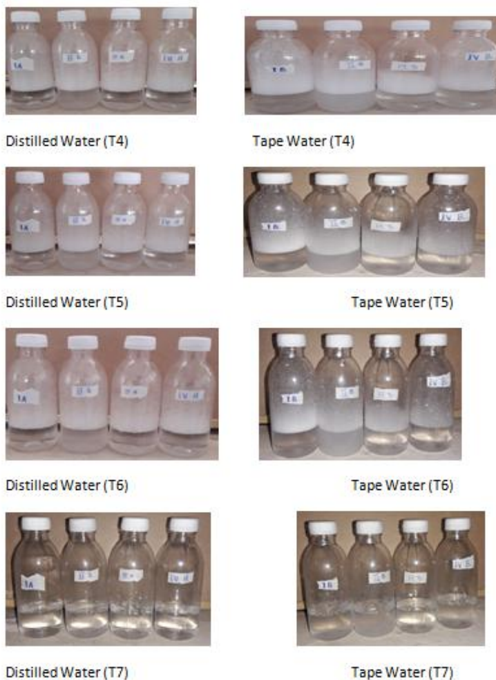
Figure 4. Showing foaming stability using 1.00 g of various detergents solutions w.r.t time (T1-T7)