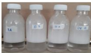
Distilled Water (T2)