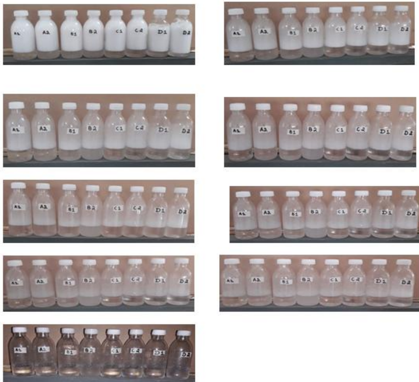
Figure 1. Showing foaming stability using 0.01 g of various detergents solutions w.r.t time (T1-T9)

figure and table 1 respectively. The literature survey also depict that those detergents having excellent foaming ability and maintained height are better detergents for cleaning purposes and economic point of views [1-5] .