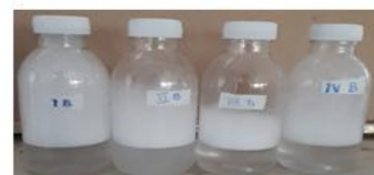
Tape Water (T2)