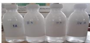
Distilled Water (T1)

In performing test 4 for foaming stability, the bottles were labeled as I-A,II-A, III-A and IV-A for detergent solution prepared in distilled water and I-B,II-B, III-B and IV-B for detergent solution made in tape water as shown in table 4 and their camera pictures in figure 4. 1.00 g of detergents I, II, III and IV were dissolved in tape as well as in distilled water to prepare their solutions. The solutions then shake for 5-10 minutes for uniform foaming and complete solubility of the detergents in water. The bottles were kept tight by lid to prevent air and dust particles. The solutions bottles were placed on smooth surface for observation and taking pictures at regular interval. The time interval is kept 30 minute and last picture is taken after 24 hours for study the foaming stability in form of bubble foam and noting height of the foam and bubbles above solution surface. From the studying and thorough observations of the foaming and height of the bubbles and foaming above solution surfaces, it reveals that detergent A and B show good foaming stability than the other two as shown in figure 4 and table 4.