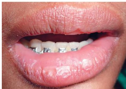
Figure 10. Nickel allergy.

Latex allergy: Since the mid-1980's, Introduction to Natural Rubber Latex (NRL) in the clinical environment has increased knowingly because of concerns over the transmission of viral infections, such as Human Immunodeficiency Virus (HIV) and hepatitis B. This has resulted in protective gloves, being worn regularly for clinical procedures, usually made from NRL where contact with bodily fluids may occur. When these gloves are worn, corn-starch powder contaminated with protein is deposited on the skin (Figure 11). Also, when they are put on or removed, the powder spreads into the air and can be inhaled, contacting mucous membranes leads to reaction [25].