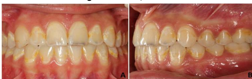
Figure 1. White spot lesion.

White spot lesions, if left untreated, lead to cavitation; hence the proper diagnosis, treatment, and prevention are necessary to minimize the enamel decalcification otherwise it will compromise the aesthetics of the patient.