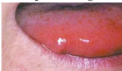
Figure 11. latex allergy.

Latex sensitivity may occur in response to contact with latex gloves or elastomeric ligatures (modules) and intra- and extra-oral elastics. The commonest sites affected are the gingivae and tongue, but the perioral region may also be affected. The reaction includes irritant contact dermatitis, Allergic contact dermatitis (Type IV response), Immediate Type I response. The Clinician should be aware of the sensitivity and manage it properly [26].