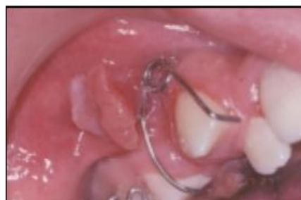
Figure 8. picture showing ulceration because of removable appliance.

Management: Before fabricating any removable appliance, undercuts should be cautiously evaluated in the plaster model and blocked out prior completely. Also, care should be taken while insertion and removal of the appliance by removing any sharp edges in the appliance to avoid trauma. Afterward, Patients should be recalled a few days (approx. 7 days) after appliance delivery to check for any tissue impingement or trauma [20].