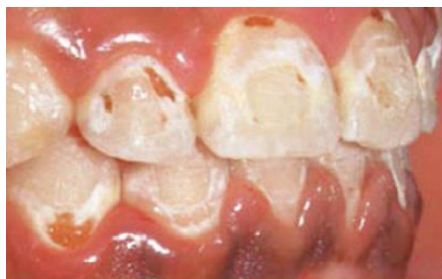
Figure 2. Post-debonding photograph showing areas of enamel decalcification of anterior teeth and enamel fracture of the upper left incisal edge.

The incisal edges of the upper anterior teeth, buccal cusps of upper posterior teeth, and upper canine tips are frequently affected areas during debonding (1.2) Zachrisson found that the frequency of pronounced cracks was 6% for debonded/banded teeth and 4% for untreated teeth about the total number of cracks. However, chemically bonded ceramic brackets showed more cracks in comparison [10].