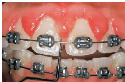
Figure 3. Picture showing gingivitis and gingival enlargement.

Zachrisson and Zachrisson, et al stated that even after sustaining excellent oral hygiene, patients usually experience mild to moderate gingivitis within 1 to 2 months of appliance placement. It is transient and does not lead to any additional complications, such as loss of gingival attachment except for 10 % of adult patients.