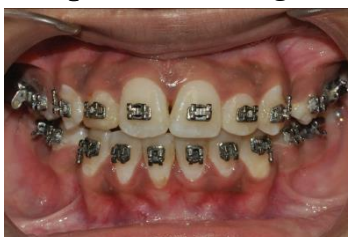
Figure 5. Black triangle.

Cunliffe, et al. found that interdental "black triangles" were esteemed as the third most hated aesthetic problem below caries and crown margins. A black triangle can give source to patient complaints such as aesthetic problems, phonetic problems, food impaction, and oral hygiene maintenance problems. Hence, it must be treated as early as possible to minimize the complications.