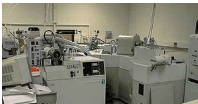
Figure 1. A five sector mass spectrometer.

A popular combination of these sectors is Bagnetic-electric-magnetic (BEB). Most modern sector instruments are double-focusing instruments in which ion beams focus is controlled for its direction and velocity [6] . The behavior of fragmented samples in ionic form is important in any MS technique. It depends on a homogeneous, linear, static electric or magnetic field (separately). For example, as is found in a sector instrument ( Figure 2 ). Like other MS, the sector based MS is also governed by two laws. One