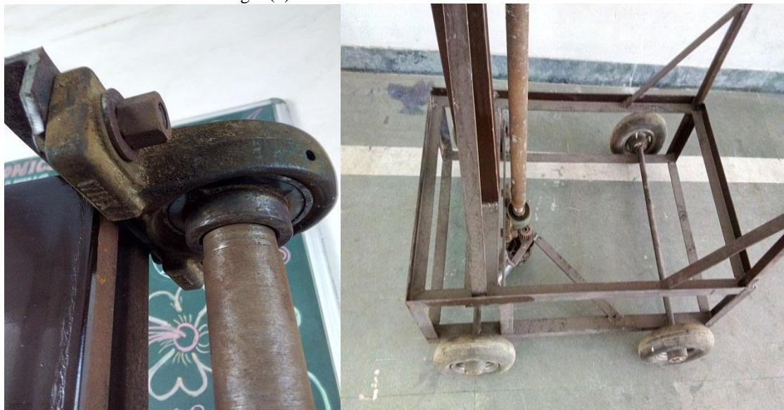
Fig.2 Design specifications (a) Journal bearing (b) Mechanical base

Base, as the name implies it is the base setup upon which all whole mechanical setup is kept. The base has a gap of rectangular shaped which is used to keep the battery, Lead screw and the electrical components. Size of the base setup is 120 cm x 80 cm x 50 cm which is shown in Fig 2 (b).