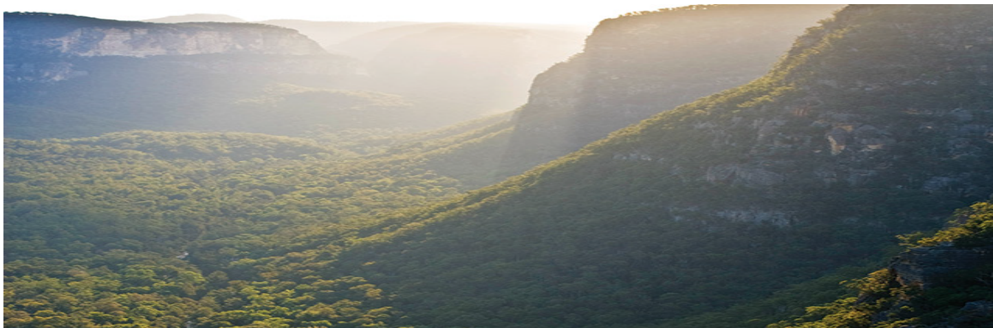
Figure 1. Wollemia national park.