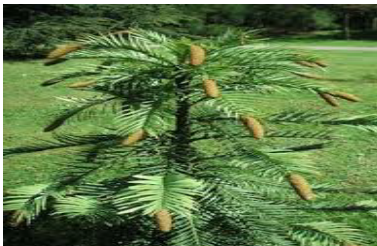
Figure 2. Wollemia nobilis (botanic garden university of leicester).