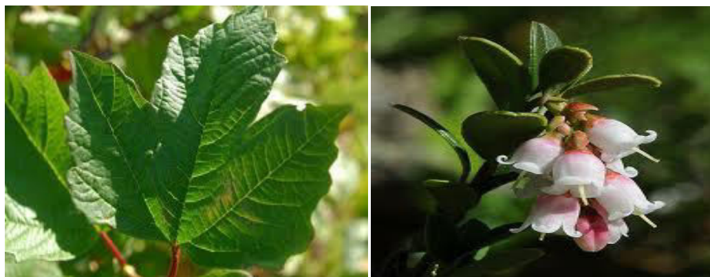
(a) (b) Fig. 7. Parts of plant Vaccinium oxycoccos (a) Leafs (b) Flowers.

Flowers- White or yellowish flowers are found in groups.