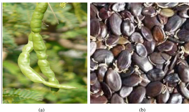
Fig. 11. Parts of plant Acacia Arabica (a) Fruits (b) Seeds.

Seeds- Seeds are depressed, subglobular. A deep woody tap root with several branching surface laterals.