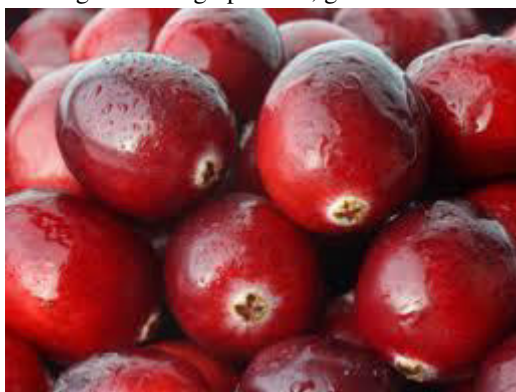
(a) Fig. 8. Part of plant Vaccinium oxycoccos (a) Fruits.

Fruits- They are avoided with 5-1 hard angles curving up wards, glabrous with five to seven wings, woody and fibrous.