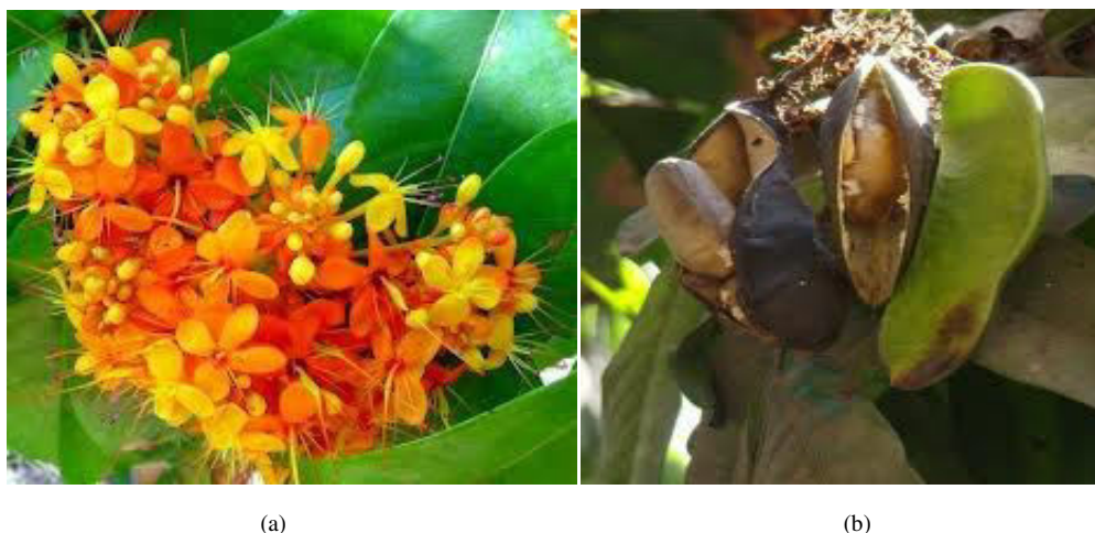
Fig. 2. Parts of plant Saraca indica (a) Flowers (b) Fruits.

Fruits – It is a pod, flat, oblong and apiculate.