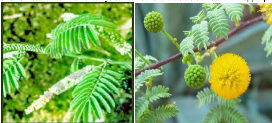
(a) (b) Fig. 10. Parts of plant Acacia Arabica (a) Leaves (b) Flowers.

Leaves — It is a twice compound they consist of 5-11 feather like pairs of pinnae and each pinna is further divided into 7-25 pairs of small, elliptic leaflets that can be bottle to bright green in colour and its stalks are heavy and contain very small gland almost no noticeable with the naked eye can be found at the base of most of the upper pinnae pairs.