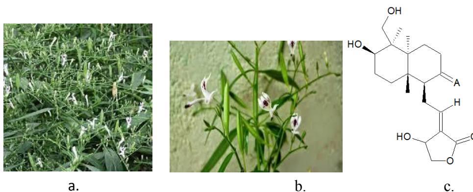
Figure 1. Andrographis paniculata (a) Plant; (b) Flowers and fruits; (c) Andrographolide

both the ends. The plant is abundantly available in South East Asian countries, Sri Lanka, Pakistan, and Indonesia and cultivated extensively in China, Thailand, East and West Indies and Mauritius [4] . It is found in wild throughout the plains of India especially in Tamil Nadu, Karnataka, Maharashtra, Orissa, Uttar Pradesh and Uttarakhand.