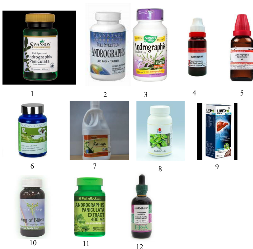
Figure 4. Healthcare and well-being products developed from Andrographis paniculata

1. http://www.swansonvitamins.com/swanson-premium-full-spectrum-andrographis-paniculata-400-mg-60-caps