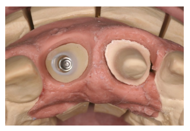
Figure 1. Die master and abutment with individual emergence profile.

The Abutment was fabricated using the Atlantis Virtual Abutment Design-Software (VAD) (DENTSPLY IH GmbH). Depending on the individual anatomic situation, the system comprises different options for a customized design of the abutments emergence profile. It further offers the possibility to compensate the position of prosthetically not ideal placed implants through different angulation options for the abutments. The basis for the milling process, performed by the manufacturer with the VAD-software, was a 3D-Scan of a plaster casted model with a gingival mask made of silicon (Picodent Dental-Produktions Vertriebs GmbH) and Wax-up around the duplicate abutments in the respective implant region ( Figure 4 ). The technician himself determined the required abutment design, by transcribing the instructions firstly in a special virtual entry form, and sending the data subsequently via internet to the manufacturer. After the milling process, the finished abutment, made of zirconia, was delivered to the technician with a corresponding abutment screw ( Figure 5 ). After that, the abutment was placed on the model and the final prosthetic restauration was manufactured by the dental technician ( Figure 6 ).