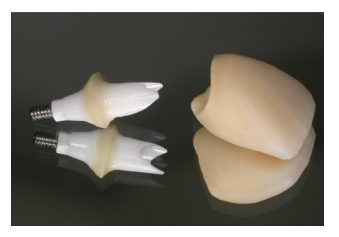
Figure 2. By Ceramill ZI veneered prefabricated abutment.