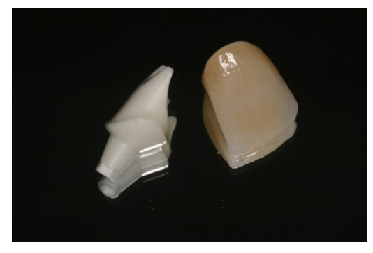
Figure 6. Zirconia atlantis abutment and crown.