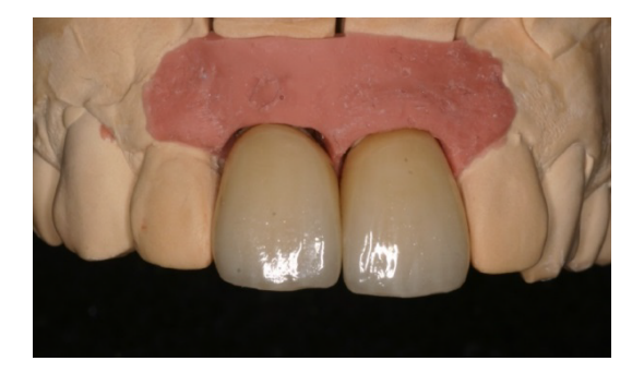
Figure 3. Die master and crowns.