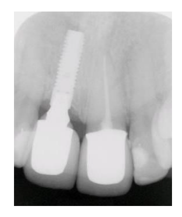
Figure 11. X-ray control after placement of abutments and crown.