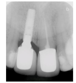
Figure 12. X-ray control after 1 year.