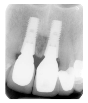
Figure 14. X-ray control after 1 year.

Figure 13. X-ray control after placement of atlantis abutments and crown.