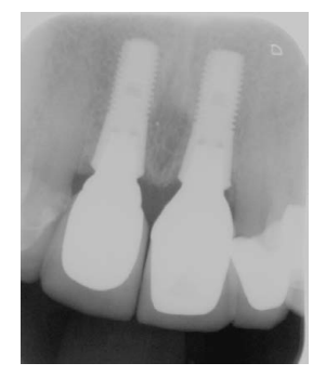
Figure 13. X-ray control after placement of atlantis abutments and crown.