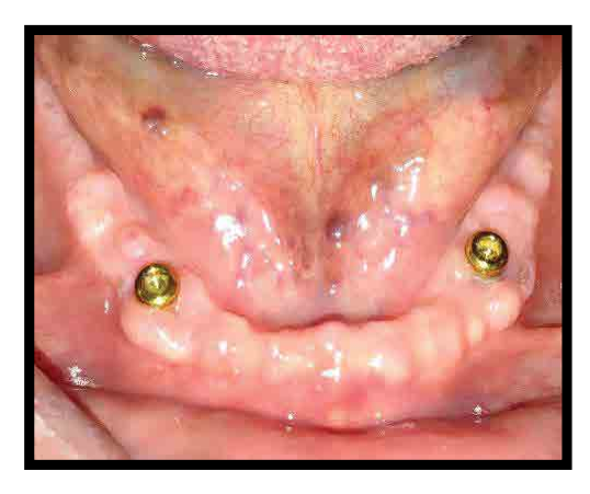
Figure 4. Locator attachment in place.