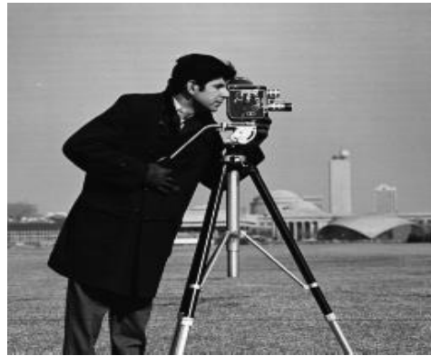
Fig 2: Original Image For Wavelet Transform.

The input image is 8 bits per pixel, gray scale test image, 'Cameraman' from MATLAB toolbox is utilized in the simulation has a resolution 256x256 pixels.