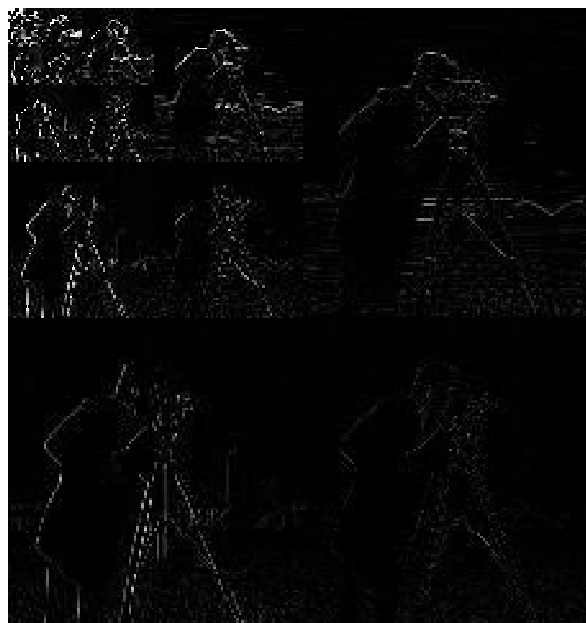
Fig 3: Partition Image Up to 8 Levels

The input image is 8 bits per pixel, gray scale test image, 'Cameraman' from MATLAB toolbox is utilized in the simulation has a resolution 256x256 pixels.