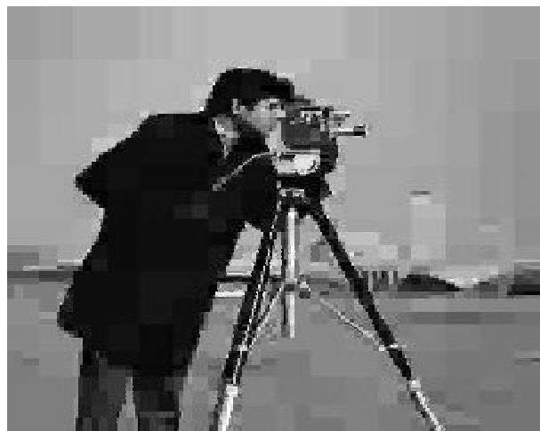
Fig 5: Received image after encoding and decoding