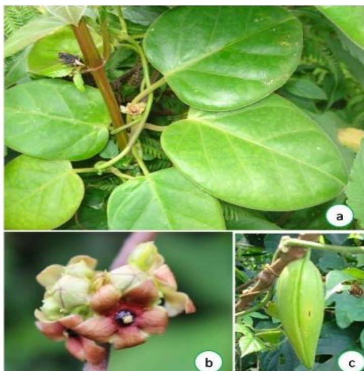
Figure 1. Habit of Tylophora subramanii a) Flowering twig; b) Inflorescence; c) Folicle fruit.