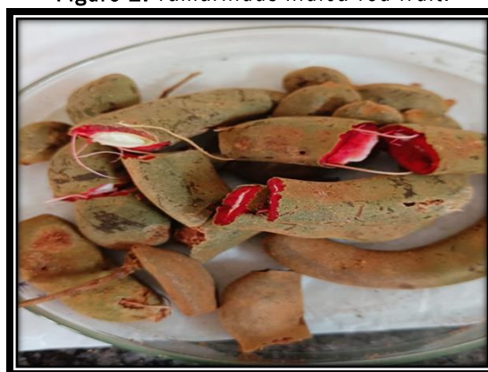
Figure 2. Tamarindus indica red fruit.

Other benefits: Fruit pulp used as gentle laxative. It improves appetite. Decoction of dried fruit is taken orally for fevers. It is known to restore sensation in paralysis. Tamarind bark is used as tonic, lotions and to relieve sores, ulcers rashes [8].