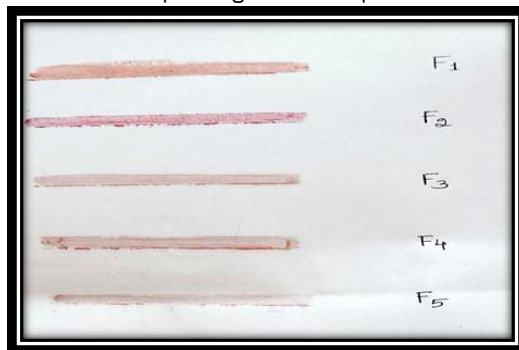
Figure 6. Colour imparting test for lipstick formulations.

Melting point: Melting point of all the lipstick formulations was found in between 60-61°C. Thus all the formulations poses typical lipstick property. Moderate melting property of lipstick prevents its melting during storage and promotes ease of application on lips. The melting point results were depicted in Table 7. The melting point assembly was represented in Figure 7.