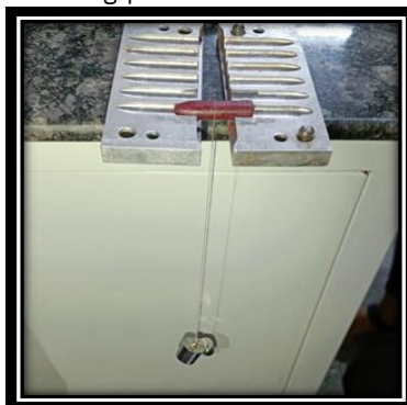
Figure 8. Breaking point determination of lipsticks.

Breaking point: Breaking point of lipsticks was ranging from 70 grams to 120 grams. As the wax content in the formulation increases there is frequent increase in breaking strength is been observed. Formulation F 5 shows maximum breaking point and formulation F 1 shown least breaking strength because of lesser amount of wax content. The breaking strength results were depicted in Table 7. Breaking point assembly was depicted in Figure 8.