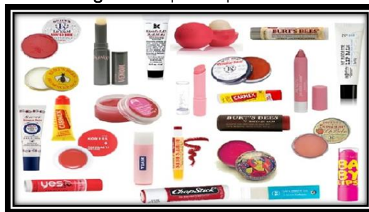
Figure 1. Lip care products.