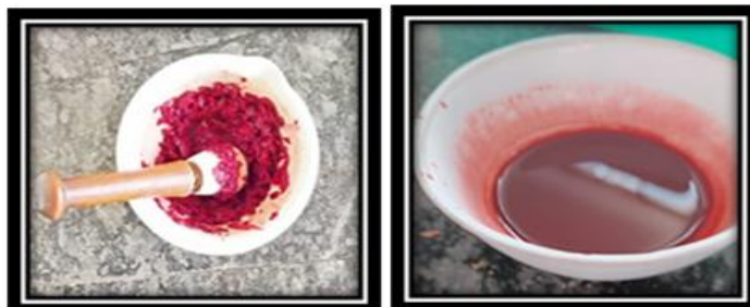
Figure 3. Extraction of natural pigment from Tamarindus indica red.

The colour pigment from Tamarindus indica red fruit was obtained by trituration followed by evaporation method. The dark red natural pigment from Tamridus indica red was obtained and stored in a refrigerator for further lipstick development process. The extracted pigment was shown in Figure 3.