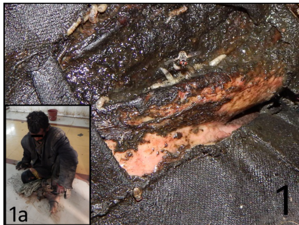
Figure 1. Maggot infected knee of the patient. 1a. Patient

parasite and normally lays its eggs on carcasses. The first instar maggots feed on exudations of the decomposing flesh. The eggs may also be laid on neglected wounds where the larvae can cause tissue destruction. There was no previous report regarding distribution of Chrysomya albiceps (Wiedemann) in West Bengal of India. Chrysomya megacephala (Fabricius), the latrine fly is widespread throughout India and South East Asia with many recent introductions in many parts of the world. The larvae of this fly species develop generally in carrion or on dead and decomposed tissues [4] Chrysomya megacephala (Fabricius) also involve in myiasis [5]. The larvae of this fly caused umbilical myiasis in neonate [6] and aural myiasis [3]. (Figures 1 and 2).