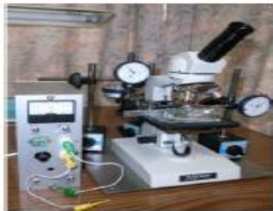
Fig.1. Micro-EDM Machine Set-Up

The experimental set-up shown in the fig.1 has been used to study the micro-EDM process. This set up can be used for both machining and investigating the micro-holes through microscope lenses without removing the work piece from the worktable. The present experimental set-up used to study the micro-EDM process consists of a RC type generator. This generator can produce pulses from few tens of nano-seconds to few micro-seconds. The power supply can vary voltage levels from 45V to 120 V. An Optical microscope is used to investigate the micro-holes formed by micro-EDM set up. Fig. 2 shows a schematic diagram of micro-EDM.