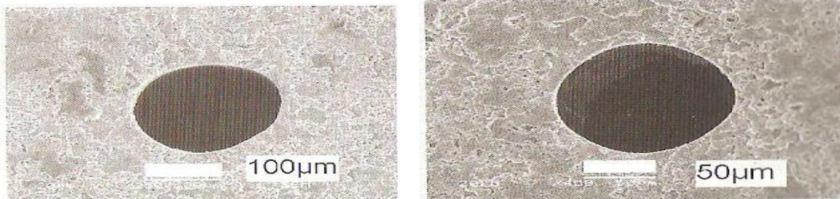
Fig : Micro-holes Shapes at Entrance(left) and exit (right) using 100µm and 50 µm diameter of electrode