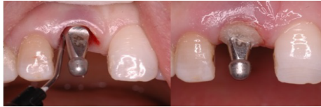
Figure 8. Impression taking of soft tissue contours.

fabricated by the use of standard impression coping and flowable composite material (Filtek Supreme Ultra Flowable Restorative, 3M Espe, Minnesota, USA). Standard impression coping was screwed to the implant and flowable composite was immediately applied around the impression coping to imitate the shape of gingival tissues and papilla around the temporary crown. After polymerization of the composite a custom-made impression coping was obtained ( Figure 8 ). The final implant impression was made using high viscosity vinyl polysiloxane (3M Espe Imprint 3 Monophase Impression Material, 3 M Espe Dental Products, Minnesota, USA). After the impression, impression coping was unscrewed and the sharp parts of the composite material was corrected and polished and the impression coping was screwed with the implant replica ( Figure 9 ). The cast was obtained with an accurate transfer of the emergence profile of the implant crown ( Figure 10 ).