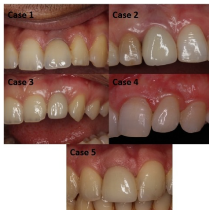
Figure 12. The final situation of all cases.

There were 5 patients ( Figure 12 ) included in this case series with a mean age of 31, 8 \pm 11 , 39. Patient's gender, implant sites, lengths, diameters, total PES, WES values and follow-up times were given at Table 1 . All of the implants were placed at maxillary lateral or central incisor position. Implant's lengths were minimum 13 mm and diameters were minimum 4 mm. The mean follow-up time was 40, 8 \pm 13 , 68 months and the mean total PES and WES values were 17 \pm 1 , 87 ( Table 1 ).