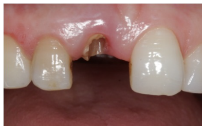
Figure 1. Broken santral incisor.

Clinical Procedures: Following the administration of local anesthetic (Articain + Epineprine), the failing tooth was removed atraumatically by the help of periostomes ( Figure 1 ). Extraction socket was than examined with a periodontal probe, if the socket walls were intact ( Figure 2 ). Platform switched and internal double hex design (Astra Tech Osseospeed TX implants, Dentsply Implants, Molndal, Sweden) were selected and implant surgery was performed by obeying the surgical rules of implant company ( Figure 3 ).