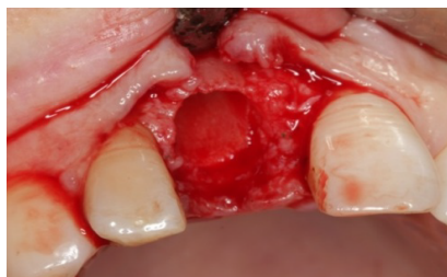
Figure 2. Socket walls.