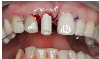
Figure 5. Immediate provisional abutment.

Primary stability of implants was confirmed for immediate provisionalization procedure. Mesial and distal papillas were then sutured with silk suture material (Dogsan, Istanbul, Turkey). Temporary abutment (Temp Design, Astra Tech Dental, Molndal, Sweden) was placed onto the implant. The centric occlusion and the shape of gingival tissues were controlled ( Figure 5 ). Abutment was then prepared extraorally and hand tightened onto the implant. A little hole was prepared on the palatal side of a plastic strip crown for implant screw driver to build up a screw-retained provisional crown. Strip crown with an autopolymerizing acrylic resin inside was applied to the temporary abutment in chair side for preparing a provisional restoration ( Figure 6 ). Screw driver was inserted inside the hole to prevent leakage of the acrylic material inside. When polymerization completed, the provisional crown screwed off and the residual acrylic materials were removed and polished. The hole was closed after screwing the implant crown, with composite material and the occlusal contacts were removed ( Figure 7 ).