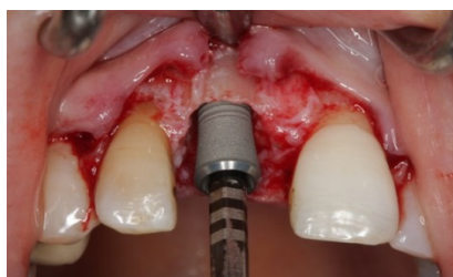
Figure 3. Implant placement.