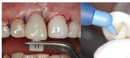
Figure 6. Provisional crown procedure.