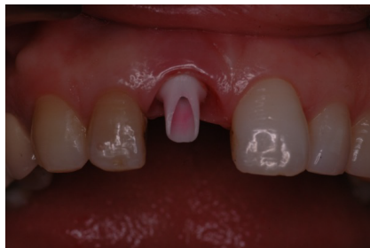
Figure 10. Zirconia abutment.

The emergence profile of the zirconium abutment was chosen by the help of this cast and was proved in-situ. The finished abutment was torque to 35 N cm and the definitive zirconia restoration was cemented ( Figure 11 ).