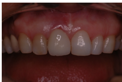
Figure 11. Final zirconia crown.

The emergence profile of the zirconium abutment was chosen by the help of this cast and was proved in-situ. The finished abutment was torque to 35 N cm and the definitive zirconia restoration was cemented ( Figure 11 ).