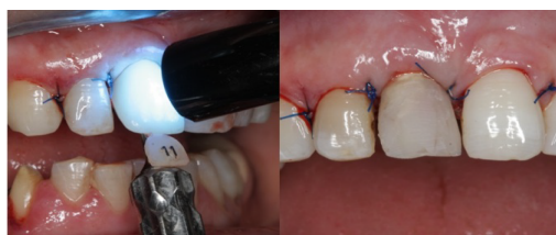
Figure 7. Screw retained provisional crown.

Appropriate antibiotic (Amoxicillin + Clavulanic acid) and analgesic (Naproxen 275) were prescribed. Patients were advised not to brush the surgical site, but rather to rinse with chlorhexidine glukonat (Benzidamin HCL + Chlorhexidine Glukonat). Also, patients were advised against functioning or activities that involved the operation site. The sutures were removed 7 days later.