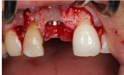
Figure 4. Implant placement in the comfort zones. ant placement.

The adjacent teeth served as a reference point and “comfort” and “danger” zones as described by Buser et al. were considered for placing the implants in an ideal position [12,13]. Dimensions of the implants were selected based on the planned restoration and the amount of available bone below the apex of the extraction socket. Mesiodistally, implants placed minimum 1, 5 mm above from the adjacent tooth to allow proper papillae formation. Orofacially, implants placed 1, 5 mm palatal from the imaginary line highlighted from the adjacent teeth's most facial point ( Figure 4 ). The apicocoronal positioning of the implant shoulder was located 2 mm apical to the midfacial gingival margin of the planned restoration or apical to the line between the zenith points of adjacent teeth. Peridontal probes were used for leveling the cemento-enamel junction of adjacent teeth. If the buccal bone was not intact or the gap between the implant shoulder and buccal bone was higher than 2 mm, bone graft substitutes (Bio-Oss, Geistlich, Switzerland) have been applied.