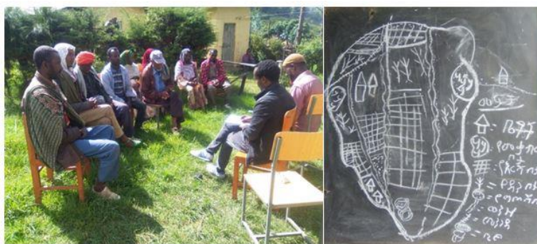
Figure 2. Group discussion and diagram of the catchment drawn by participant farmers.

Finally, for each plant species determine the score of abundance which is highly (3), medium (2), low (1) and absent or no abundant (0) for both current and past condition. Then analysis was done by using SPSS16.0 software and interpreted with the frequency of abundance and availability of the trend. The basic assumption of this study on the impact of plant diversity improvement was led through watershed development activities. In order to determine the past and present plant diversity status, focus group discussion was made with the local community (Table 1).