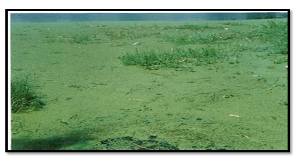
Figure 1. Photograph of a eutrophic water body in Sonamua, Tripura.

When the water body becomes eutrophic, dense population of planktonic algae develops which commonly known as algal bloom or plankton bloom ( Figure 1 ). Development of algal bloom by Anabaena, Fragilaria, Melosira, Microcystis and Oscillatoria were observed in such eutrophic water during study period <sup>[1,5]</sup>. Plankton bloom when exist under abundant sunlight, they contribute oxygen to the water through photosynthesis, but under prolonged cloudy weather, they begin to decay and consume more oxygen than they produce leading to oxygen depletion of water.