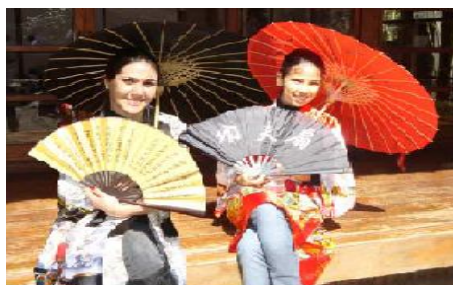
Fig.1.Example of a spliced image

Some of the image manipulation techniques are copy move, splicing, retouching etc. Among these image composition or splicing is most common. Image splicing is a technique of combining two or more images to create a fake image. An example for this is shown in figure 1. Here the images of two girls are combined to create a single image. The manipulation performed here is harmless. But in certain cases this type of manipulation will create serious issues.