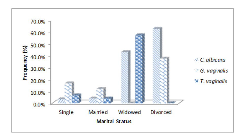
Figure 3. The distribution of aetiologic agents based on marital status among non-pregnant women.