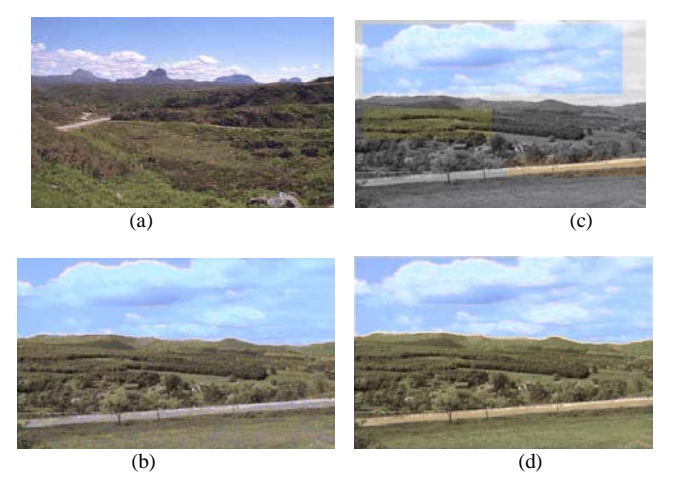
Figure 2: The two variations of the algorithm. (a) Source color image. (b) Result of basic, global algorithm applied (no swatches). (c) Greyscale image with swatch colors transferred from Figure 2a. (d) Result using swatches.