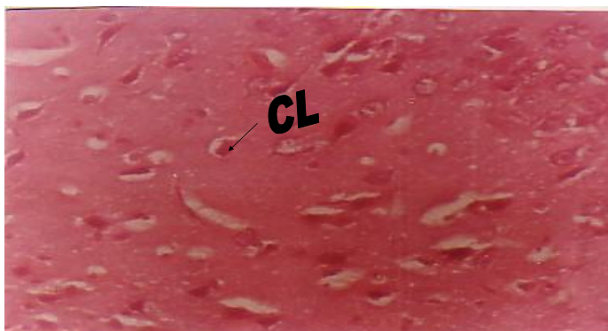
GROUP B: (H&E Stain)- the nuclei materials are seen to be clumped and pushed to the periphery of the cell. CL- clumping of pyramidal cell. Mg*250

The photomicrographs of the animals in the experimental groups (Group B and C) who were administered with 2mls and 3mls of 2g/10ml MSG revealed clumping of the nuclei material of the pyramidal cells with the nuclei material pushed to the periphery of the cell body (Fig. 2 and 3). With higher clumping and elongation of the cellular material seen in Group C (Fig.3). And as such, the distinctive features of the pyramidal cell are missing even though not completely but to a great extent. This shows that chromatolysis was precipitated in the pyramidal cells of the Wistar rats and the level of pronouncement was dose dependent.