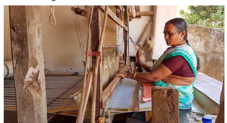
Figure 2: A weaver in rural India making a handloom fabric.

It is based on the local economy as weavers form an essential part of the rural economy, with specialized handicrafts from different regions. This local production of such fabrics reduces the carbon, water and waste footprint due to travelling and packaging and thus is a practical way of ensuring sustainability after the production stage.