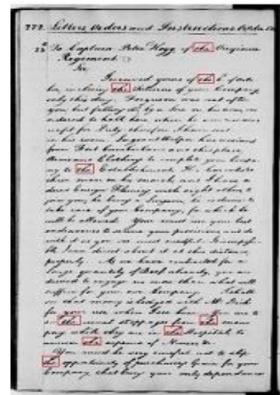
Fig: word'the'spotted in GW image