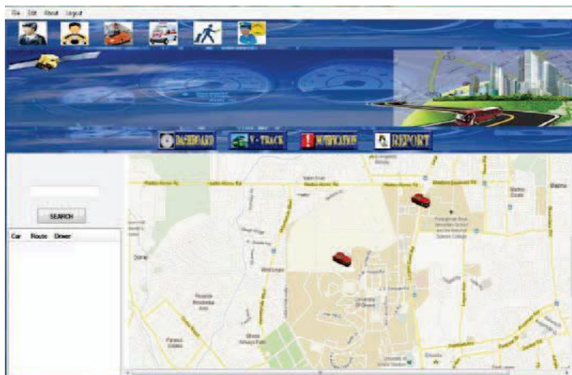
Fig.3 Dashboard for vehicle tracking and alert system

Vehicle tracking system is becoming increasingly important in rural and urban areas and it is more secured than other systems. It is more interactive by adding a display to show basic information about the vehicle and provides alert system for reporting any kind of trouble occurrences.