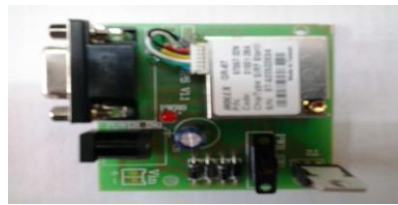
Fig.2 GPS receiver unit

E) GPS unit: The GPS receiver provides high position, velocity and time accuracy performances as well as high sensitivity and tracking capabilities. A GPS tracker essentially contains GPS module to receive the GPS signal and calculate the coordinates. For data loggers it contains large memory to store the coordinates, data pushers additionally contains the GSM/GPRS modem to transmit this information to a central computer either via SMS or via GPRS in form of IP packets.