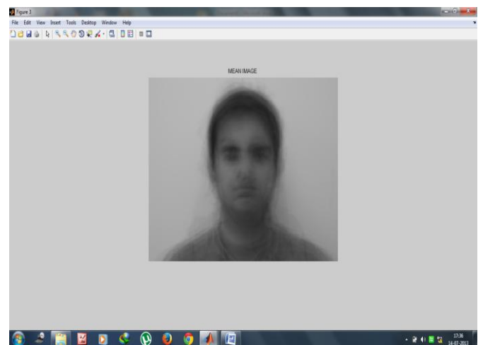
Figure 4. Avg mean image