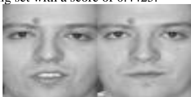
Figure 2. Matching image with testing image

Below is an example of a true positive match that was found on my training set with a score of 0.4425: