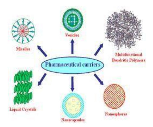
Figure 2: Types of Pharmaceutical Carriers

Colloidal drug carrier systems, for example, micellar arrangements, vesicle and liquid crystal dispersions, and nanoparticle scatterings comprising of little particles of 10- 400 nm width show incredible guarantee as drug delivery systems. The objective is to acquire systems with improved drug stacking and discharge properties, long time span of usability and low poisonous quality. The incorporated drug takes part in the microstructure of the system, and may even impact it because of molecular associations, particularly if the medication forces amphiphillic and/or mesogenic properties [90-93].